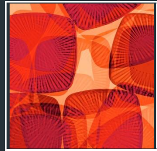
Doug Fogelson, Involution

This month I was in Chicago to visit with artists in the Windy City. One of the artists I met with was Doug Fogelson. Fogelson is a photographer who explores the many different ways a camera and film can be used to make art in a non-traditional manner. Fogelson blends single, double and triple exposure along a roll of film to create an overlapping image. By not advancing the roll of film he continues to take pictures on the same frame and overlaps different images on the same location. His goal is to show multiple perspectives of the same location and extend the length of time a photograph captures an image.