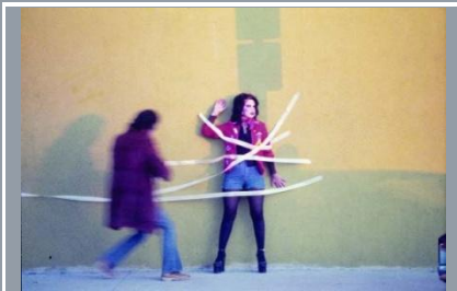
"ASCO: Elite of the Obscure, a Retrospective" at LACMA

According to the website: " Pacific Standard Time is an unprecedented collaboration of cultural institutions across Southern California coming together to celebrate the birth of the L.A. art scene. Beginning October 2011, over 60 cultural institutions will make their contributions to this region-wide initiative encompassing every major L.A. art movement from 1945 to 1980. Celebrate the era that continues to inspire the world."