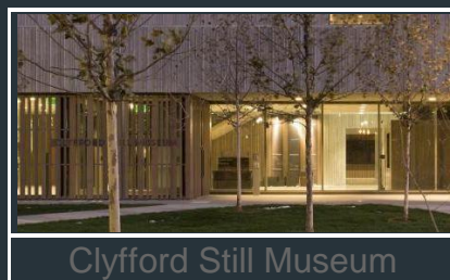
Clyfford Still Museum

The Clyfford Still Museum opened to the public on November 18. The museum houses more than 94% of the artist's work, most of which has never been seen by the public. Still, a curmudgeon who withdrew from the art world at an early period in his career, sought to preserve the purity of his art form by removing it from commercial venues. Art historians and critics gave up writing about the visionary artist for the simple reason that they couldn't view the work to write about. The opening of the museum finally allows access to the artist's work and the opportunity to view what has been hidden for so long.