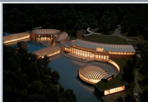
Crystal Bridges Museum

Crystal Bridges Museum of American Art opened its doors on November 11, 2011 in Northwest Arkansas. The Museum is regarded as the nation's most important new art museum in a generation, offering the type of exhibits more commonly found in New York or Los Angeles. The collection features five centuries of American art, ranging from Colonial masterworks to pieces by Andy Warhol and Nick Cave. Many of the paintings are on public display for the first time. Museum founder Alice Walton, one of the heirs to